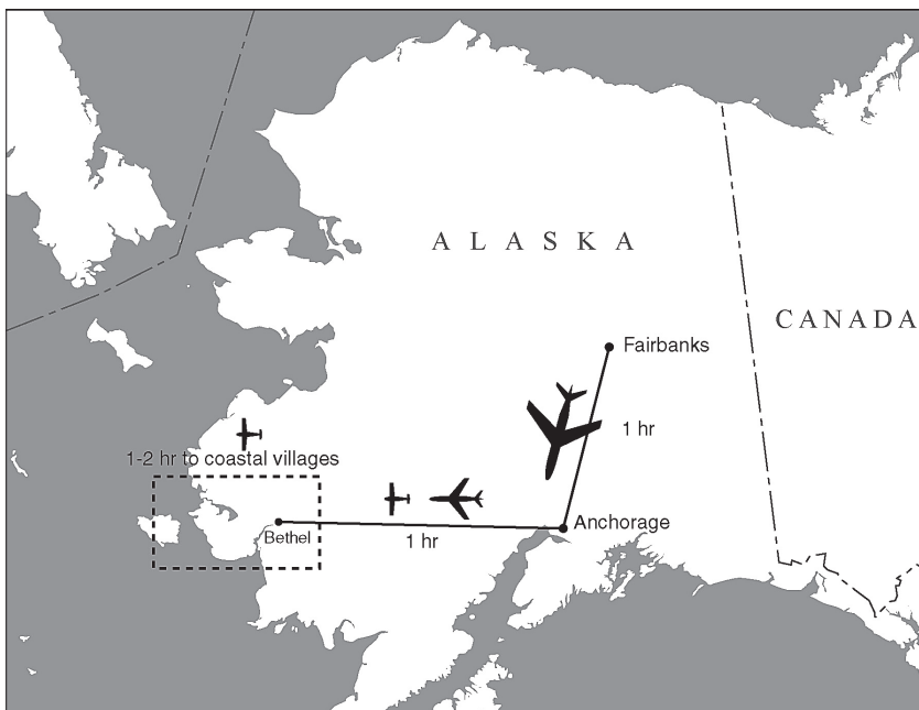
Figure 1. Map of CANHR research area.

The Alaska Native culture in the Yukon Kuskokwim Delta region in Southwest Alaska is considered among the most intact of all the indigenous groups in the state. As an example, Yup'ik, the region's indigenous language, is still the first language learned by most of the population in these rural communities. The population continues to engage in subsistence practices to generate much of their food. There are, therefore, many benefits to working in this region where we can learn about the potential power of cultural factors as influencing the protection from, or risk for, developing a chronic disease. Such knowledge is important for understanding